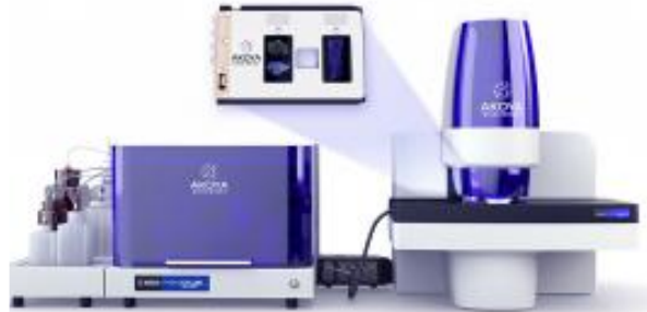
Meet the Akoya PhenoCycler Fusion